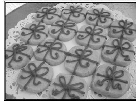
"Spice Package" Cookies

Established in 2005, the Angelica Sweet Shop offers a wide variety of baked goods and candies just right for your holiday table or gift-giving, or for everyday!